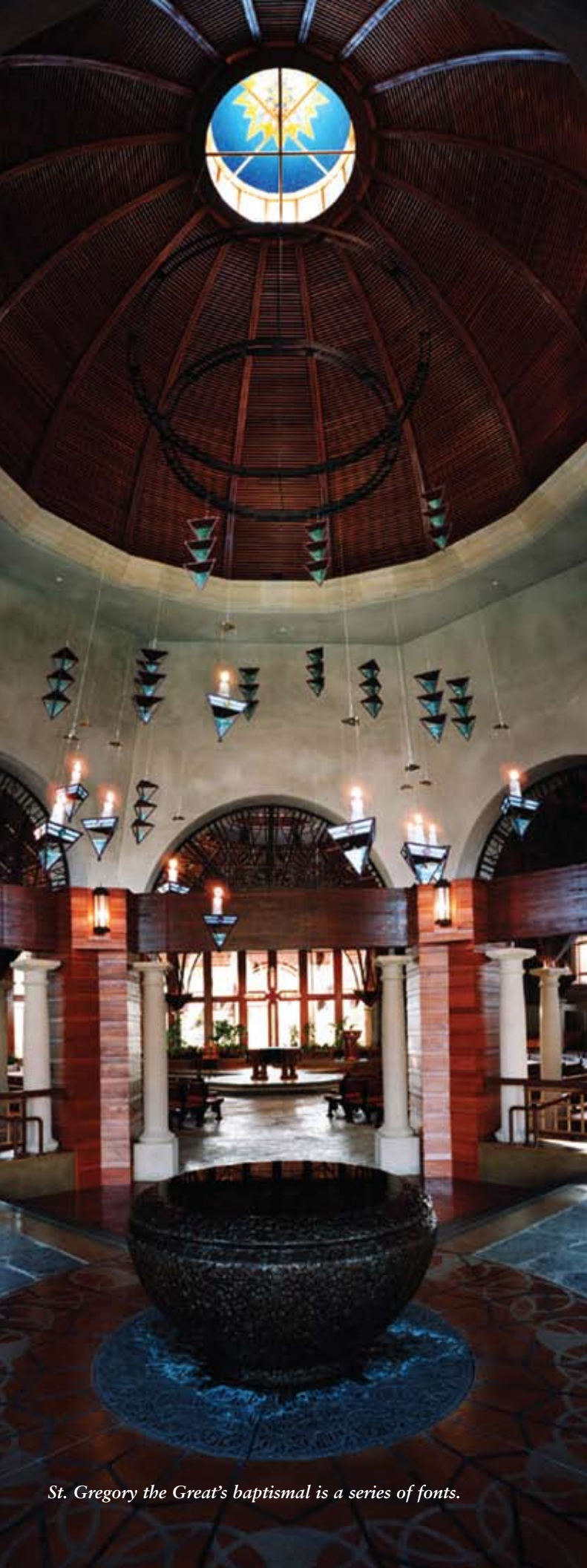
St. Gregory the Great's baptismal is a series of fonts.