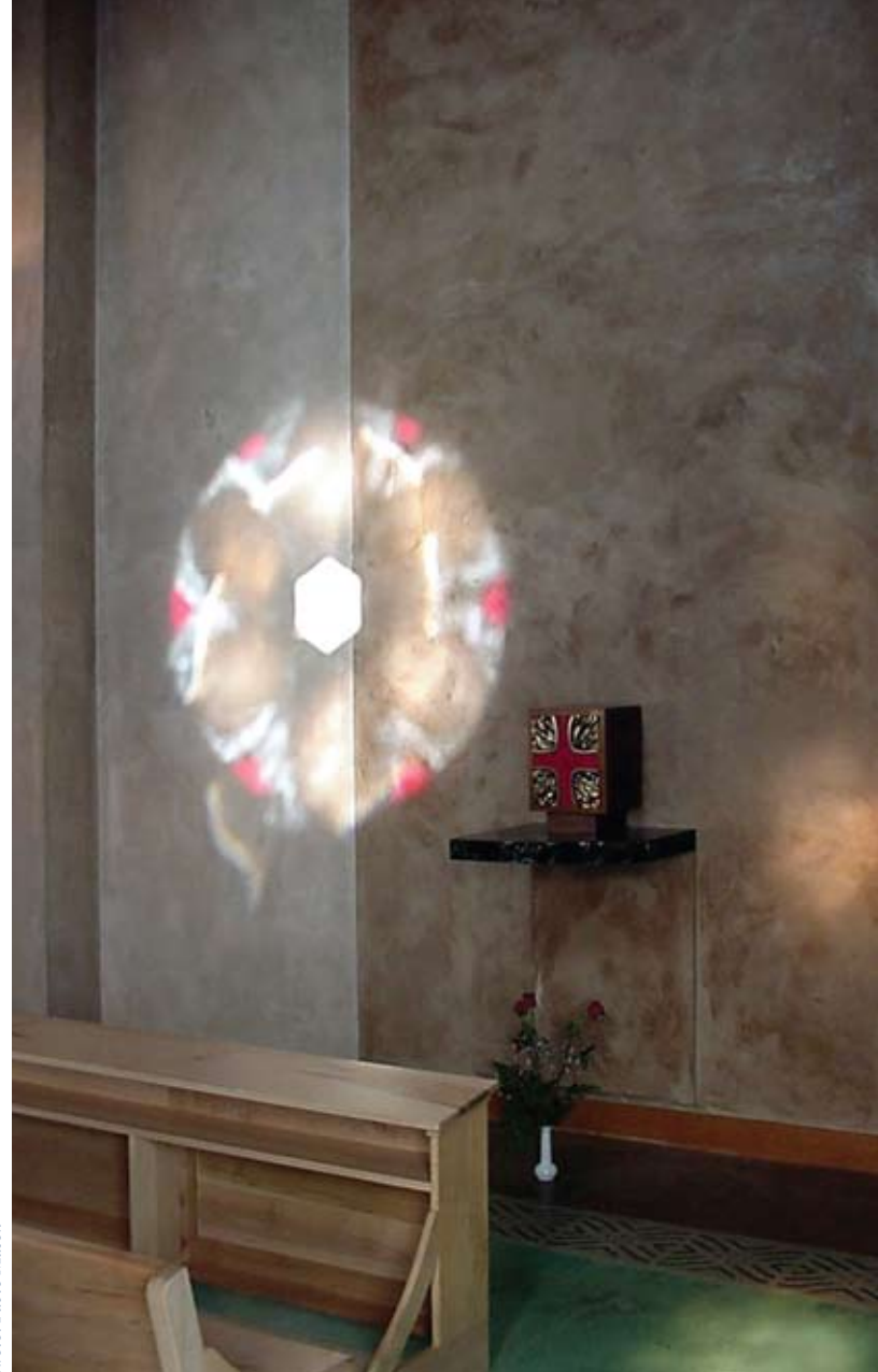
Light kisses the Blessed Sacrament Chapel in St. Vincent de Paul Catholic Church.